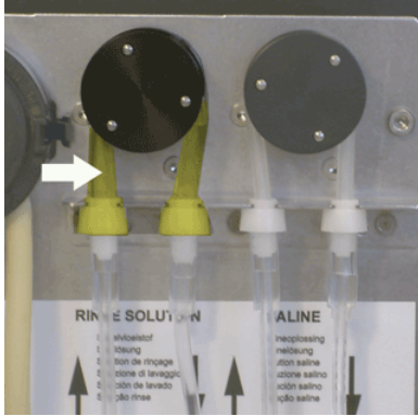
New rinse pump tube assembly ESRI090902 .